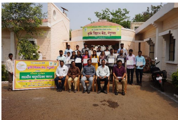
Batch 5 – Participants and Trainers