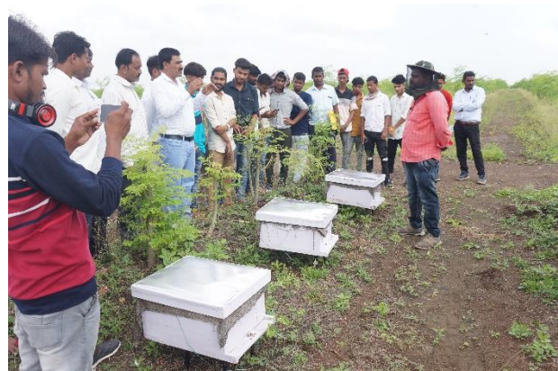
Exposure Visit to Sahyadri Farms, Ravalgaon