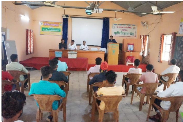
SMS, Plant Protection – Session in Progress