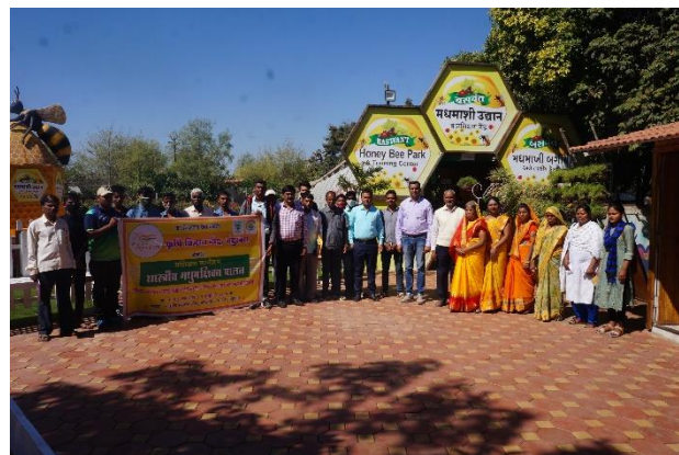
Exposure Visit to Bee Park at Pimpalgaon Baswant