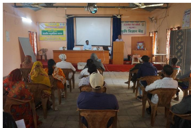
KVIC Representative addressing participants