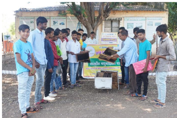
Practical Training on Handling of Bee Boxes