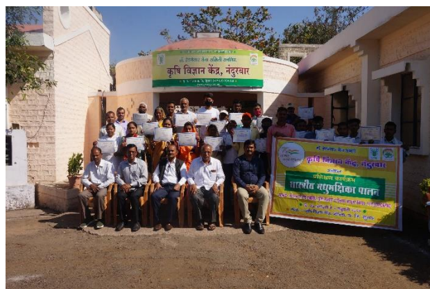
Batch 3 – Participants and Trainers