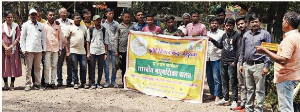
कोळदे, ता.नंदुरबार येथील कृषी विज्ञान केंद्रातर्फे मधुमक्षिका पालन प्रशिक्षणादरम्यान गुजरात राज्यात काढण्यात आलेल्या सहलीत प्रशिक्षणार्थींना मधमाशी पालन व्यवसायाबाबत मार्गदर्शन करताना उद्योजक.

Hello Nandurbar Page No. 4 Mar 23, 2022 Powered by: erelego.com