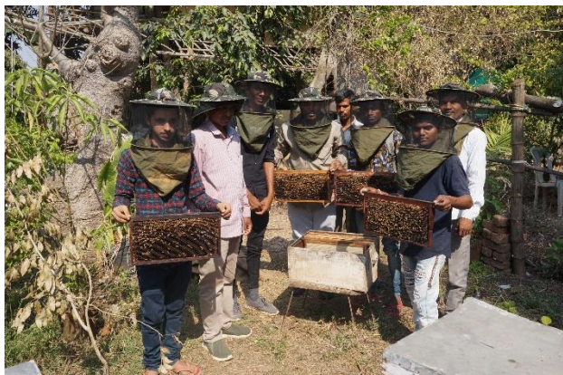
Practical Training on Handling of Bee Boxes