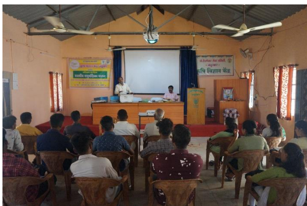
Practical Session on structure of bee-boxes