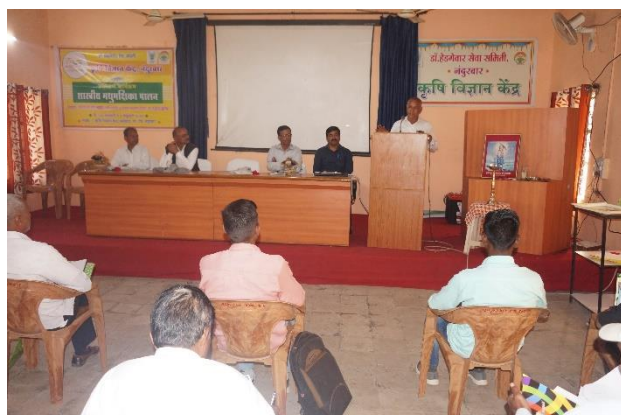
Executive Director, HSS addressing the participants in the closing ceremony