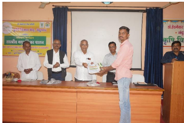
Certificate Distribution to participants