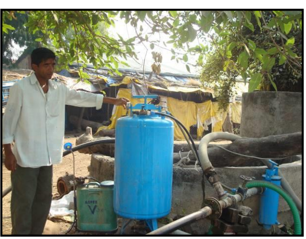
Installation of Drip