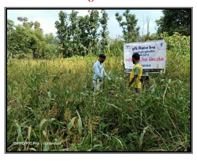
CSV 21 F