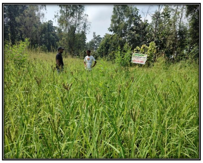
Control blast disease of finger millet