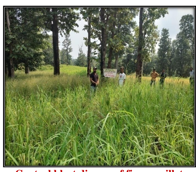
Control blast disease of finger millet