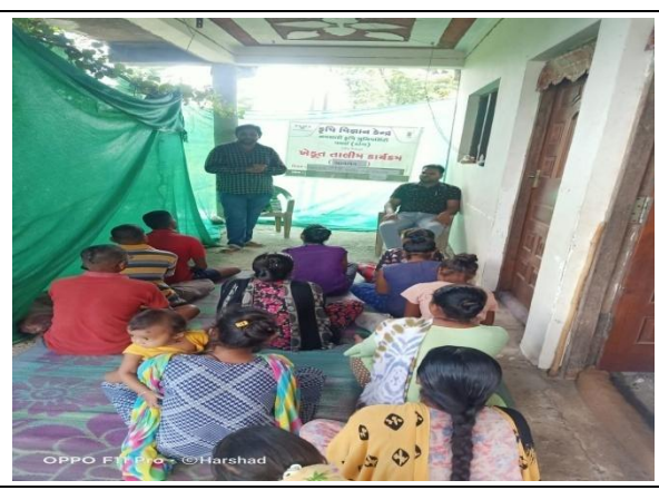
8. Celebration of International Yoga day