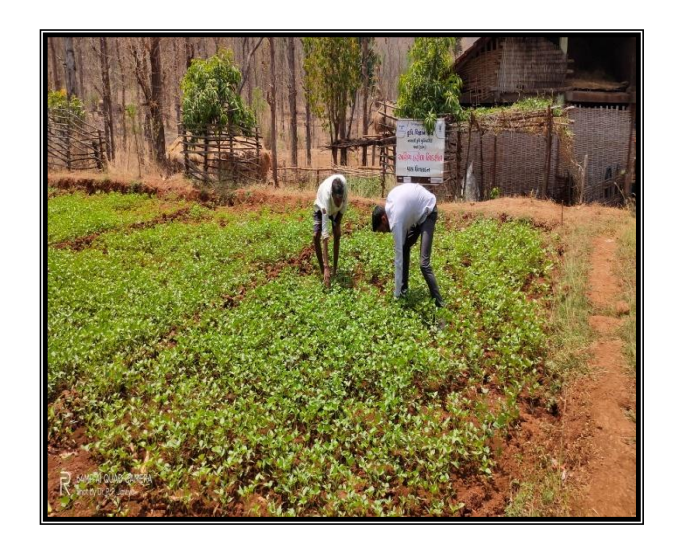
Introduction of new variety of green gram- GM 6 (TSP)