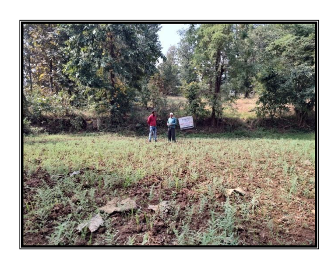
Trichoderma in Gram