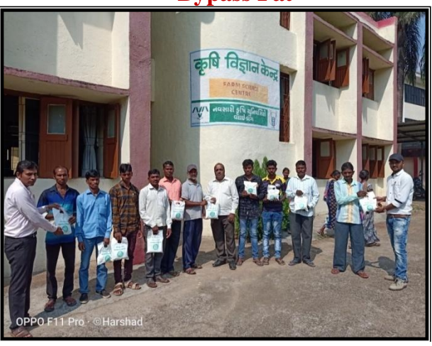
Trichoderma in Gram