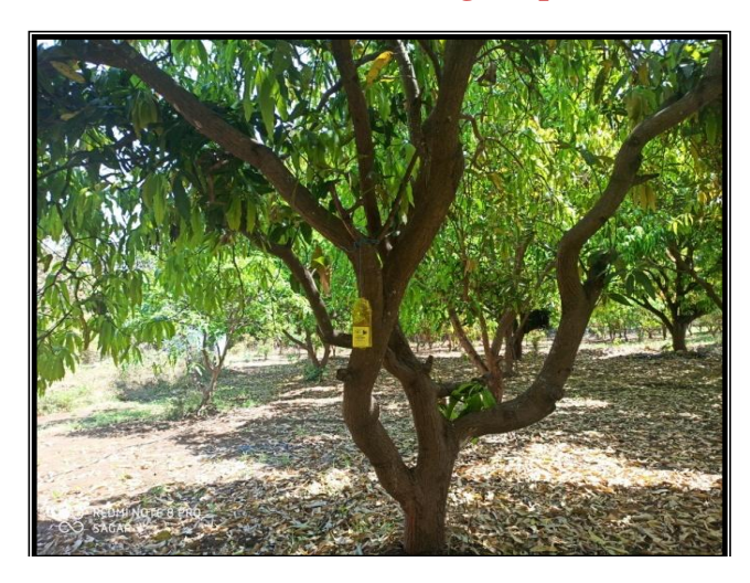
Mango fruit trap