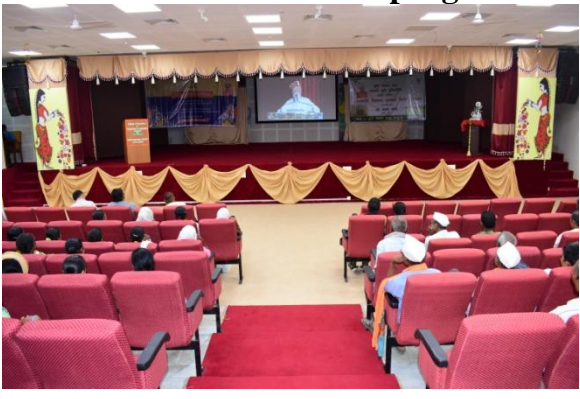
5. Awareness of Jal-Shakti-Abhiyan