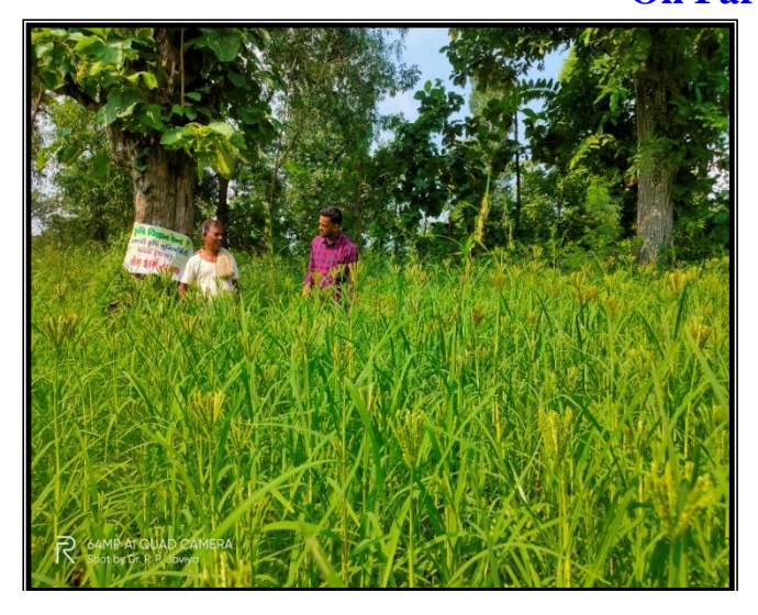
Sowing method in finger millet