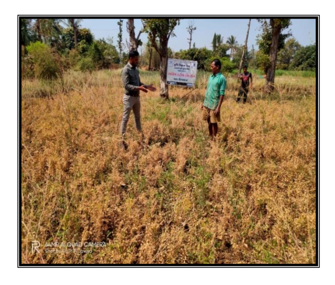
Gram GJG - 3