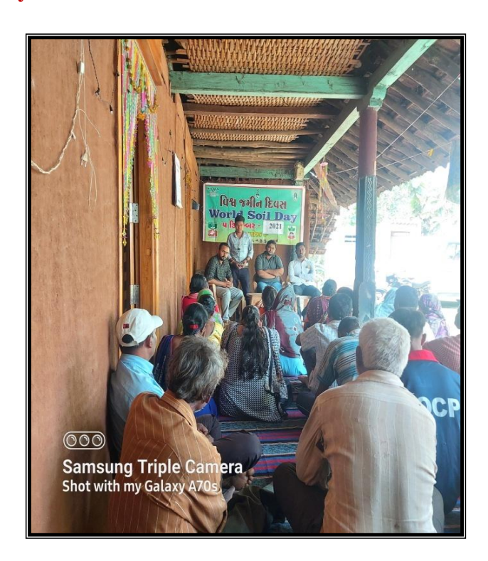
Soil sample analysis