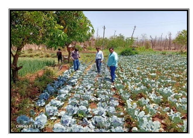
Scientist visit to farmers field