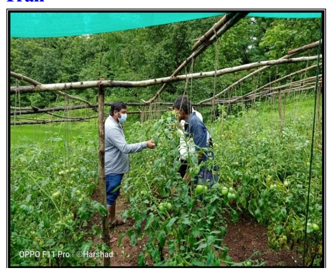
Varietal assessment of Tomato