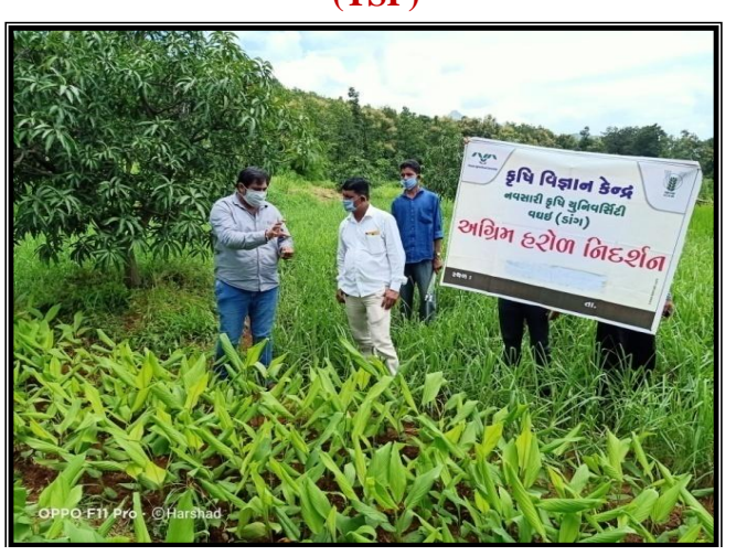
Turmeric (GNT 2)