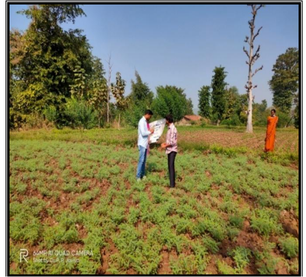
Gram GJG - 3 (Sajupada)