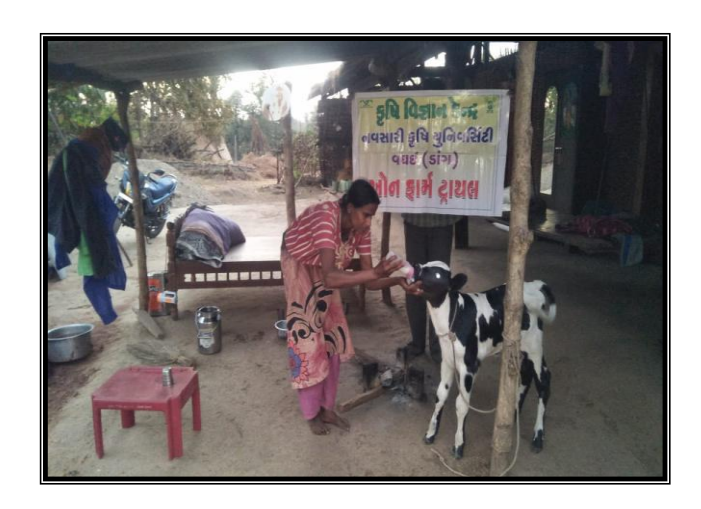
Effect supplementing mineral mixture