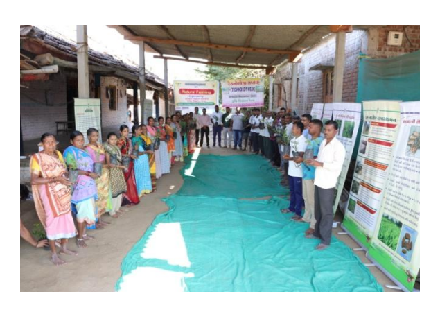
13. Celebration of world soil Health day