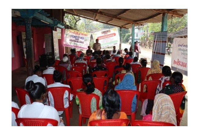
15. Celebration of International Women Day