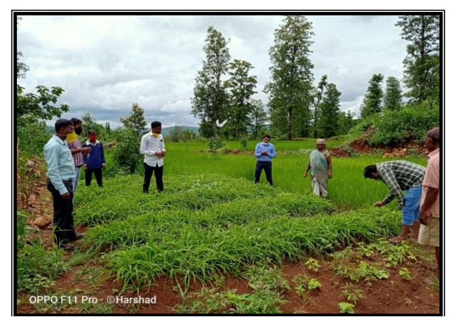
Farmers Scientist interaction