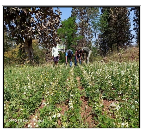
Indian bean- INGR 13043