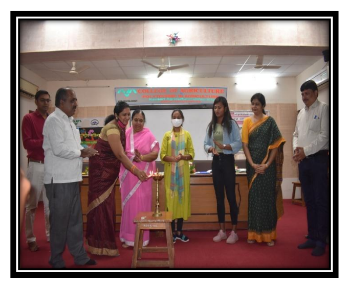
Mahila Krushi Diwas