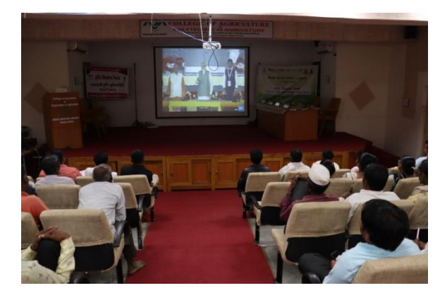
11. Celebration of PoshanMaha Abhiyan and Tree Plantation