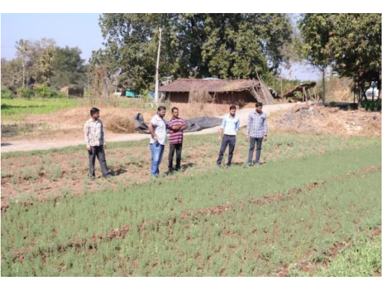
Farming for family consumption