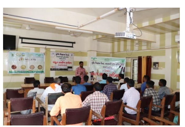
Scientific cultivation of Pigeon pea