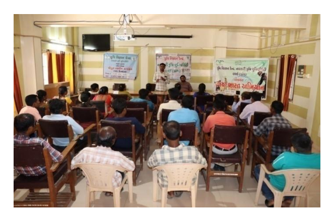
Sowing method of Paddy