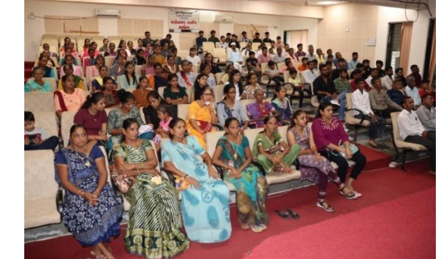
PM-KISAN SAMMAN program