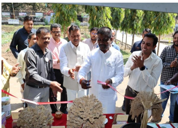
Inauguration of Millets corner