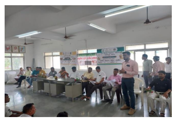
Farmer visit to KVK