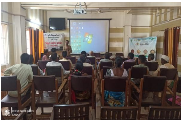
On campus training