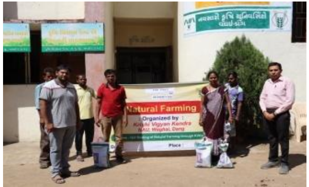
Method demonstration with title