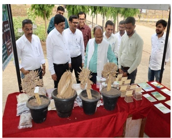
Dignitaries visit to KVK