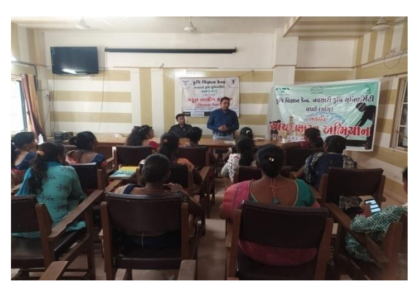
Importance of mass media in agriculture development