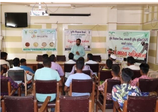
Scientific cultivation of chilli