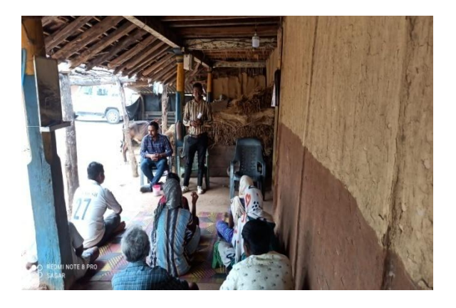
Cattle grooming, feeding & breeding