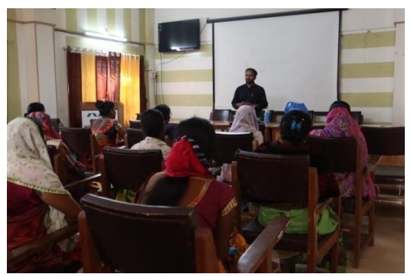
Off campus training