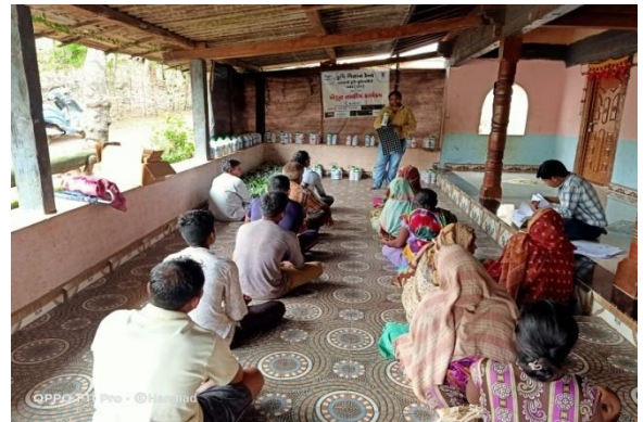
Seedling preparation in plug tray