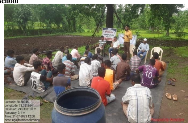
Celebrations of important day/Week