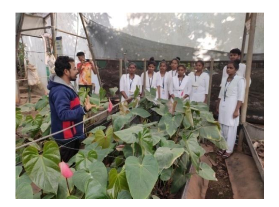
Farmers fair/Krishi mela