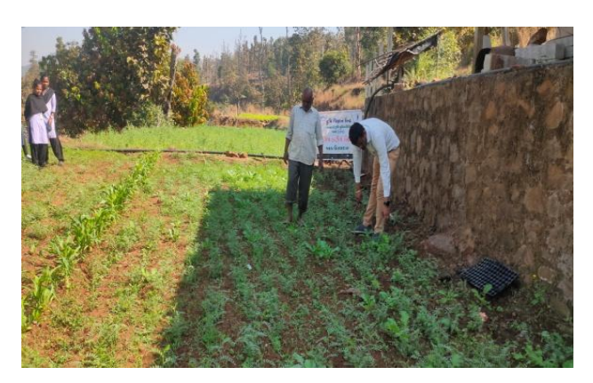
Nutrient management in gram