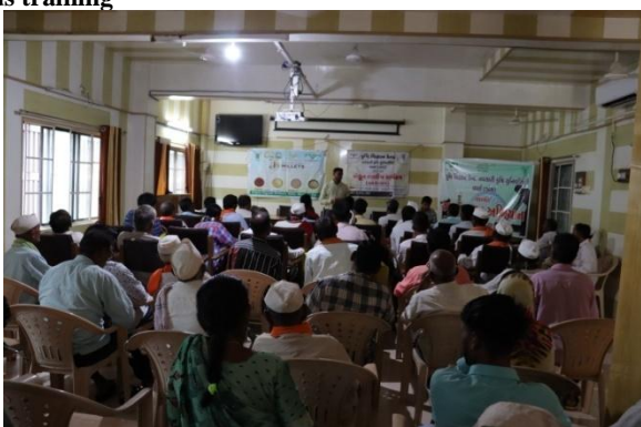
Pre sowing seed treatment to pulses