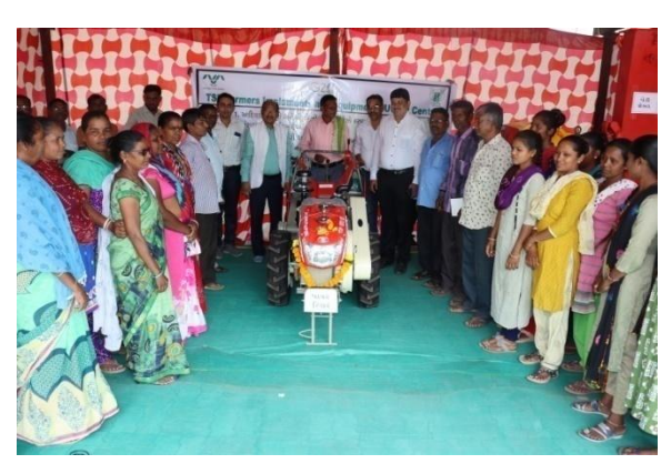
Opening ceremony of "TSP farmer implements and equipment utility center"