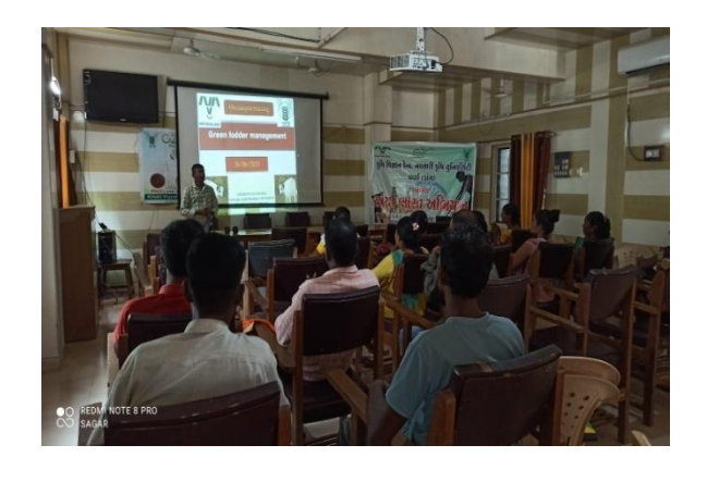
Green fodder management