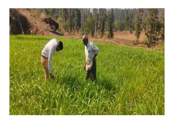
Nutrient deficiency in sorghum