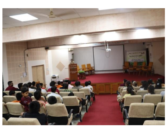
Farmer visit to KVK /Dignitaries visit to KVK