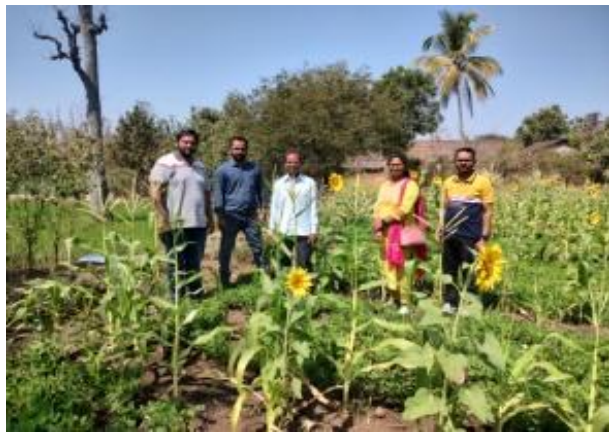
Field visits with title