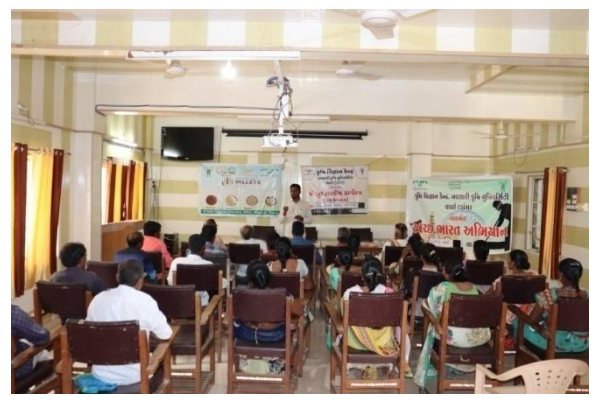
Scientific cultivation of Little millet