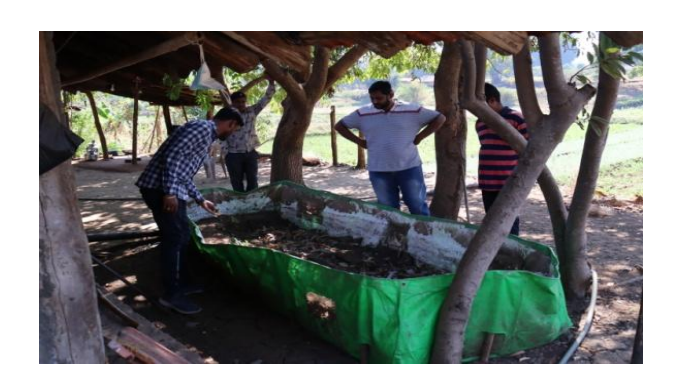
Preparation of Vermicompost