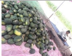
Water melon production at farmers field