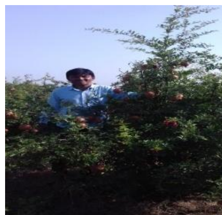
Pomegranate crop at farmers field