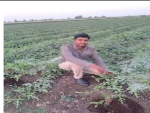
Water melon at farmers field