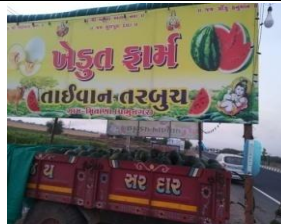
Selling water melon at his farm and road side