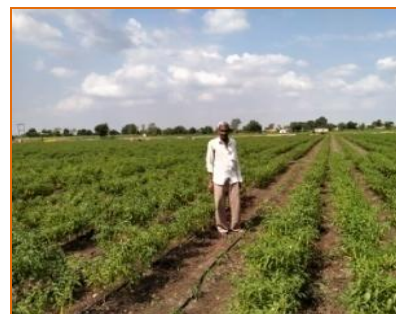
Drip irrigation in Chilly crop at farmers field