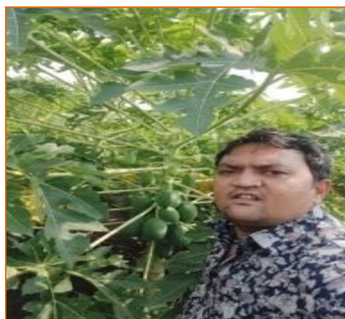
Papaya at farmers field