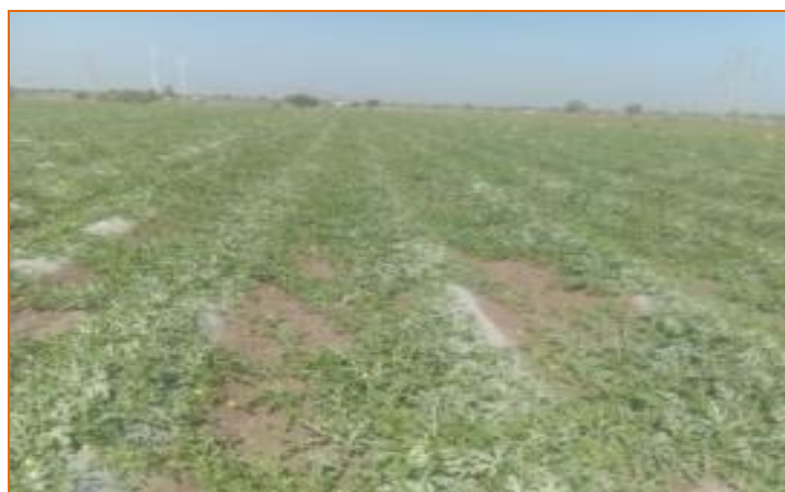
Water melon at farmers field