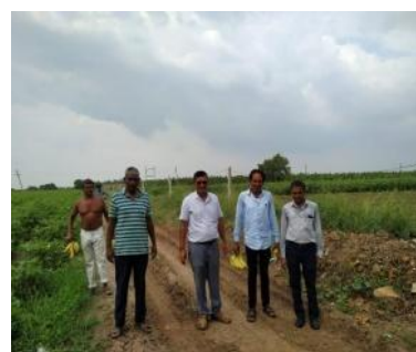
KVK scientist visited his field