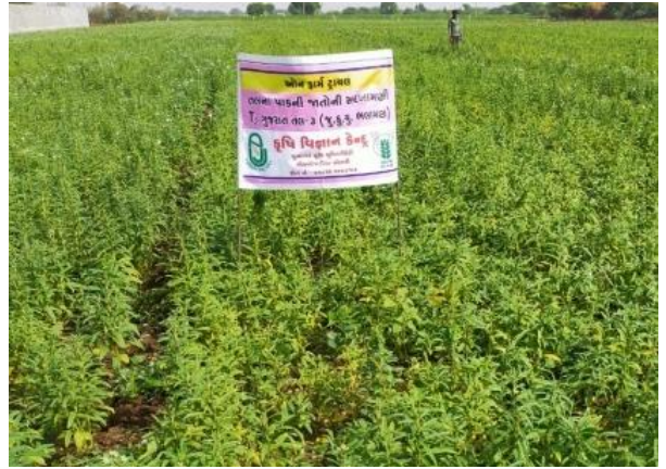
OFT on Sesame