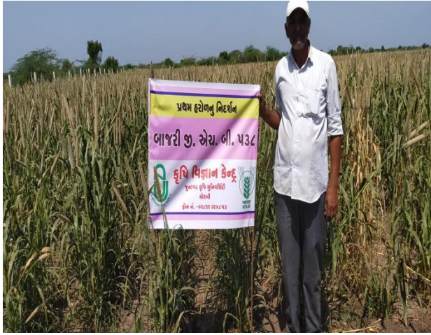
FLD on Pearlmillet GHB-538