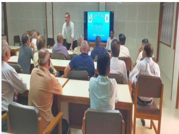
Extension workers training on natural farming 10-11-22