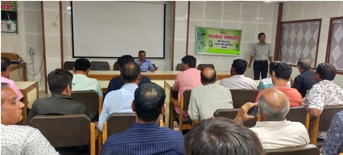
Celebration of Swachchhata Pakhavadiya 20-12-22