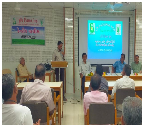
Bio fertilizer Application 19-09-22