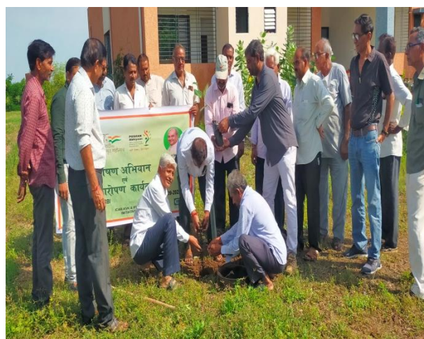
Tree Plantation 17-09-22