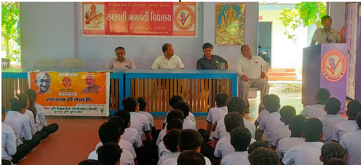
Orientation programme on sanitation in school at Barvala 11-10-22