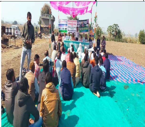
Disease and pest management at Kankot 31-12-22