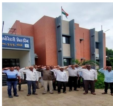
Celebration of Independence Day 15-08-22