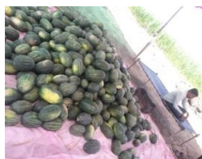
Water melon production at farmers field