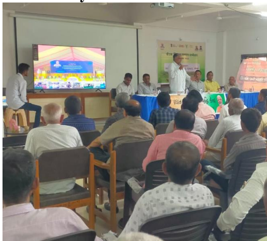
PM Kisan Sanman Sammelan 17-10-22