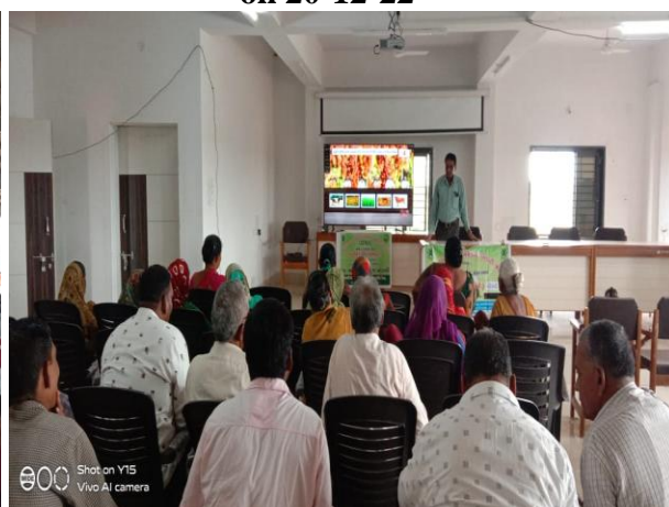
On Campus live telecast of Natural Farming on 27-06-22