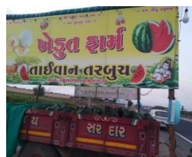
Selling water melon at his farm and road side