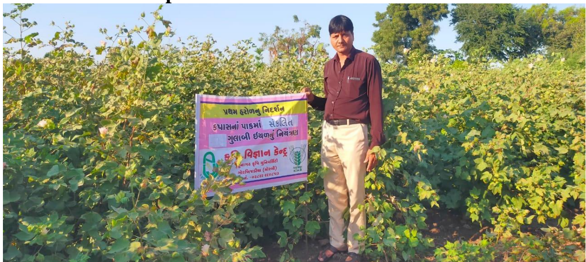
FLD on Cotton (IPM)