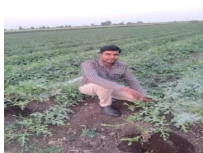
Water melon at farmers field