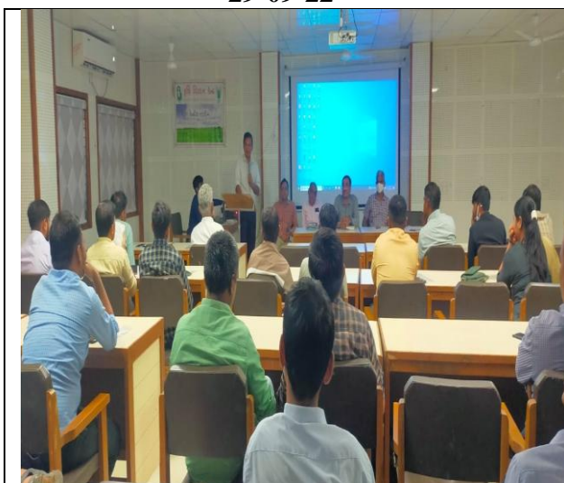
IPM and IDM in Rabi Crops 25-01-22