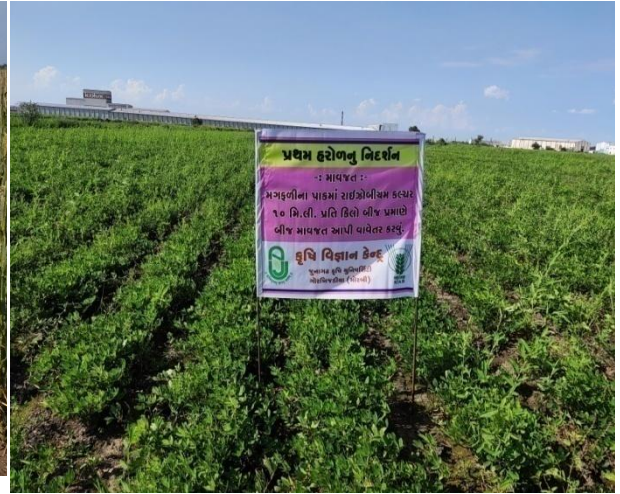
FLD on Groundnut (INM)