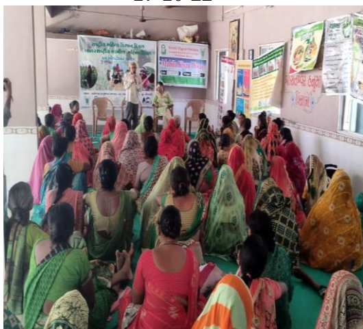
Celebration of Mahila Kisan Divas 15-10-22