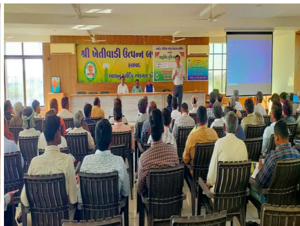
Natural farming training at Halvad on 20-12-22