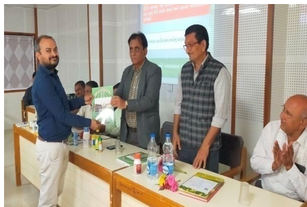
Certificate Distribution to Agro Input Dealers 19-07-22