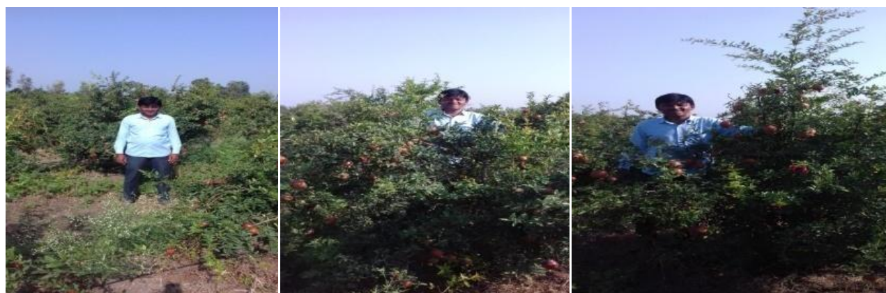
Pomegranate crop at farmers field