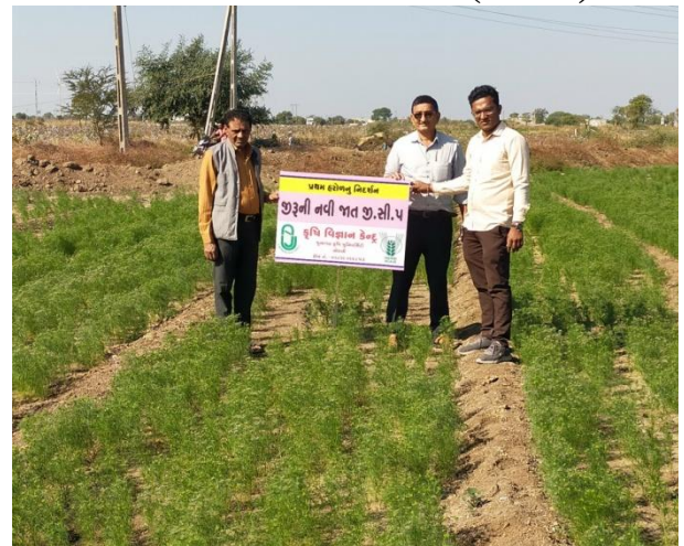
FLD on Cumin GC-5