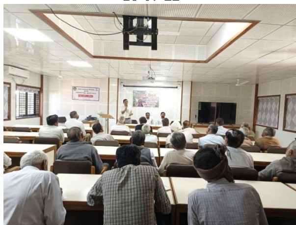
Celebration of Kisan Day 23-12-22