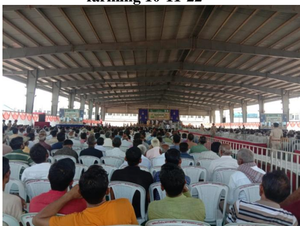
Natural farming workshop at Halvad on 10-09-22