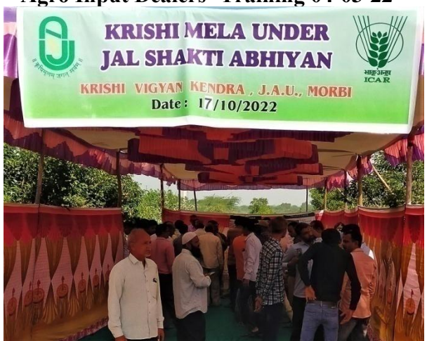
Krushi Mela under Jalshakti Abhiyan 17-10-22