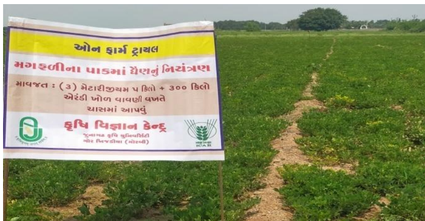
OFT on Groundnut