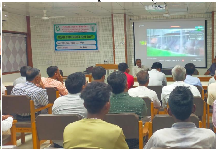
Celebratio of ICAR Foundation Day 16-07-22