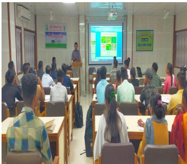
Different IPM Modules for relevant crops 29-09-22