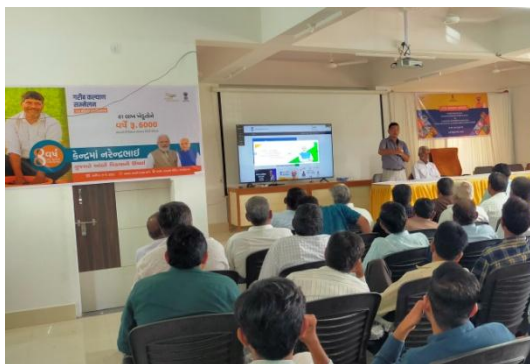
Garib Kalyan Sammelan 31-05-22