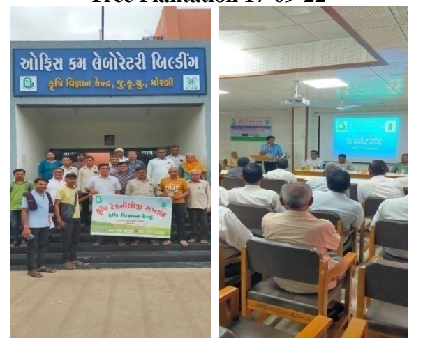
Celebration of Agri. Tech. Week 21-09-22