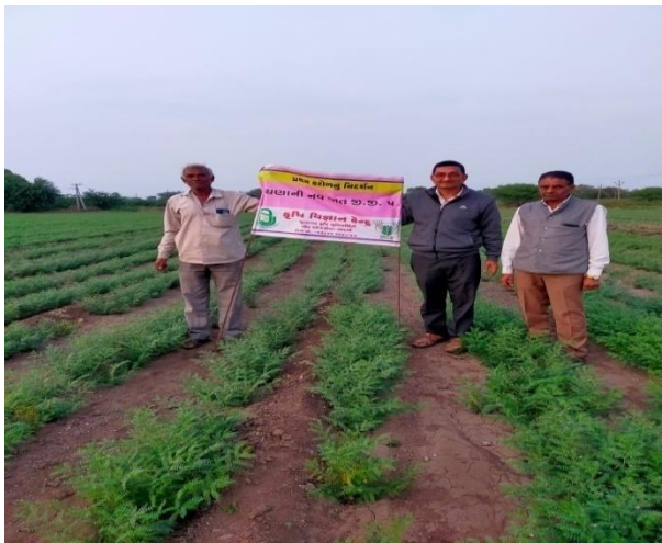
FLD on Chickpea GG-5