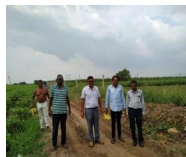
KVK scientist visited his field