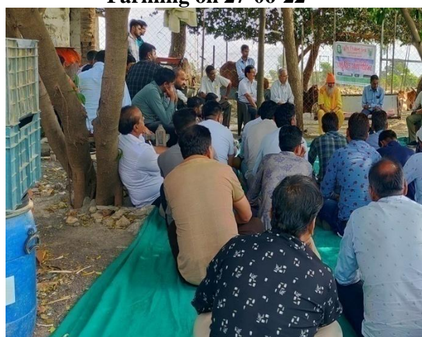
Natural Farming Shibir at Vadal on 10-03-22