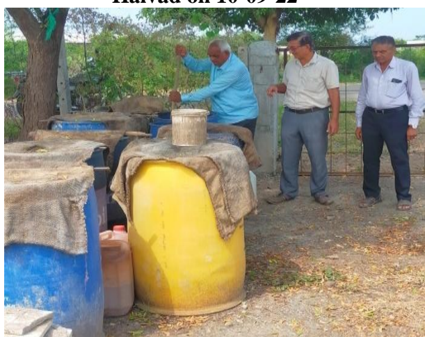
Demonstration of Preparation of Jivamrut