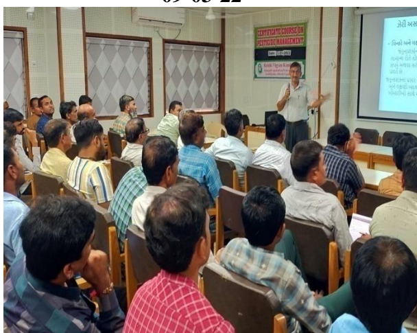
Agro Input Dealers' Training 04-03-22