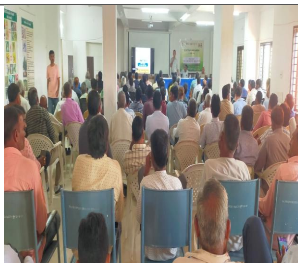
IPM in Cotton 07-07-22